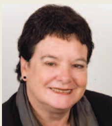
ACTU President Sharan Burrow

In the coming months we need to remind all Parliamentarians that Australians voted for the full dismantling of WorkChoices.